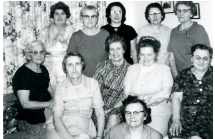
Heimtal Women's Fellowship - 1970

several events and raised money for mission projects, the church rug replacement fund and other and efforts.