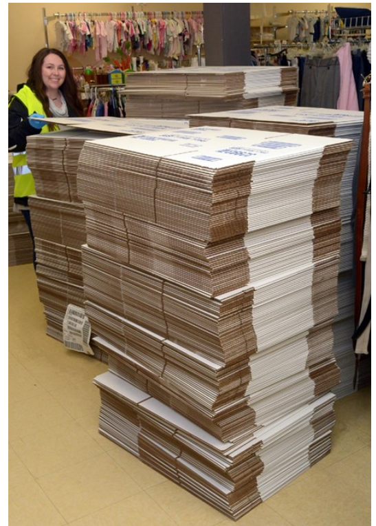
Lauryn assembles boxes