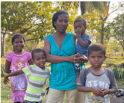
FAMILY RECEIVING THIS HABITAT HOME