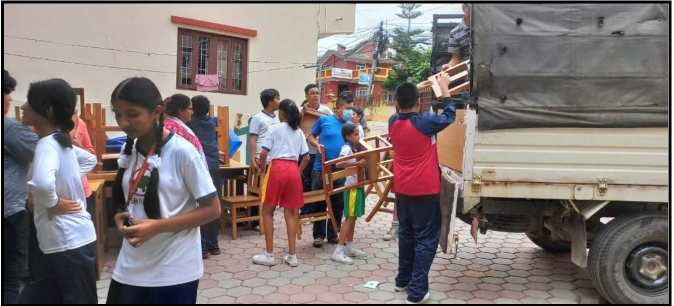
More Annex B furniture being loaded by adults and kids