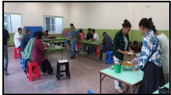
Church committee prayer and dinner