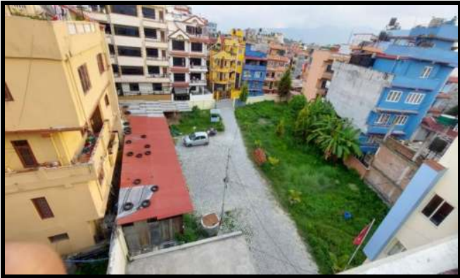
View from the 4th level: ongoing work to clear the area