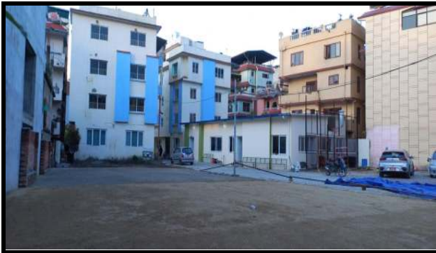
Work on futsal area stopped ... out of budget