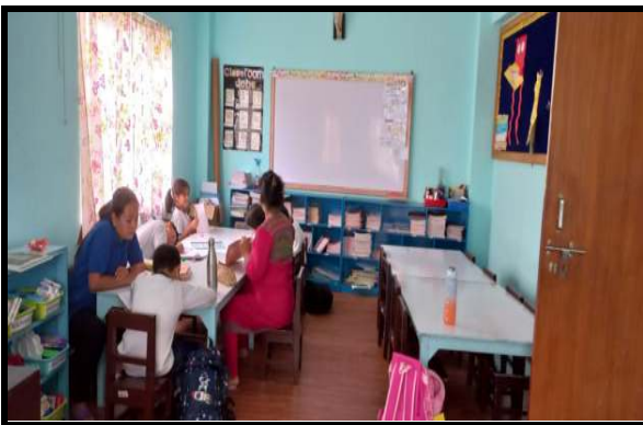
Grade 1 class ...