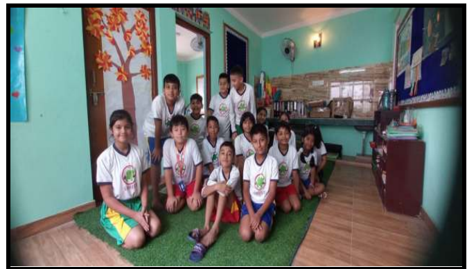
Grade 4 class ... happy in their new space