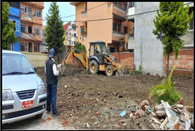
Machines at work