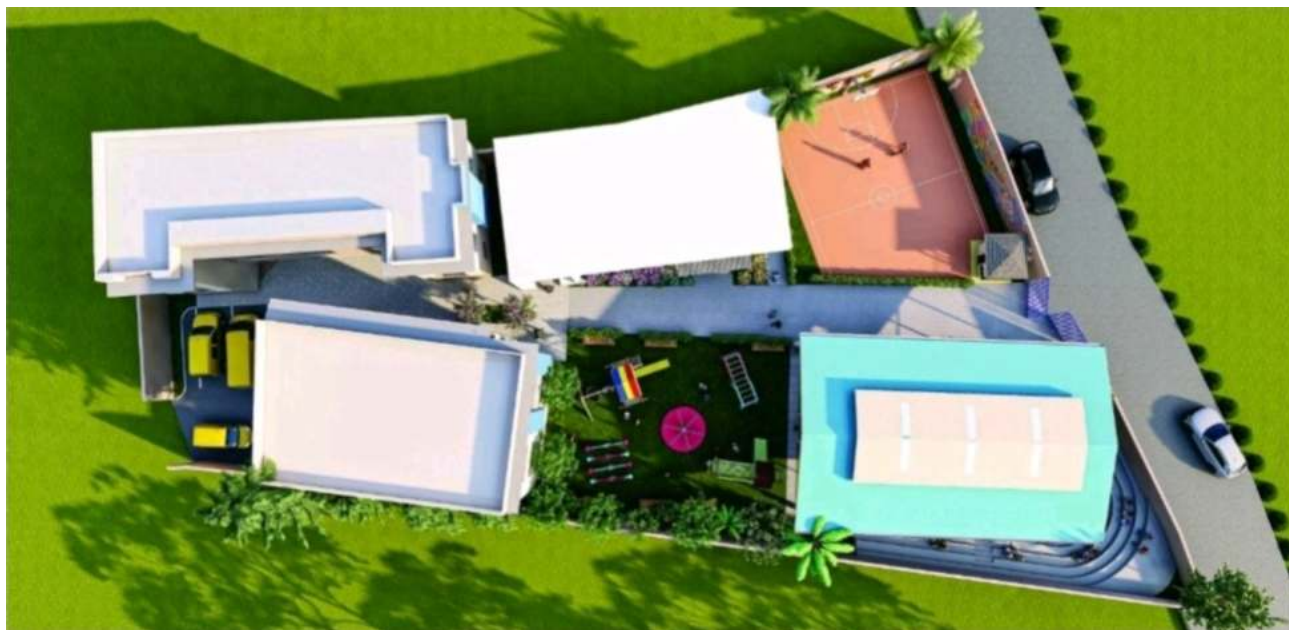
3D model of the new Shristi Academy featuring more facilities

Being confident of this, that he who began a good work in you will carry it on to completion until the day of Christ Jesus. (Philippians 1:6)