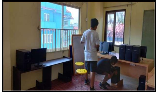
Grade 8 boys setting up the ICT Lab