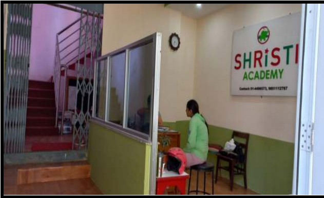
Almost functional reception