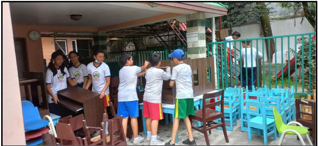
Annex A furniture brought down from classrooms by the students