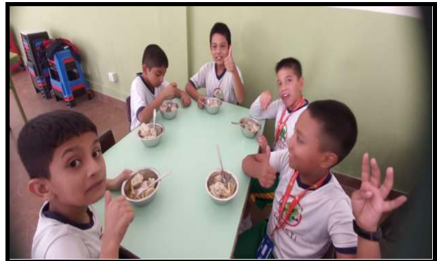
Enjoying chicken momos and fries