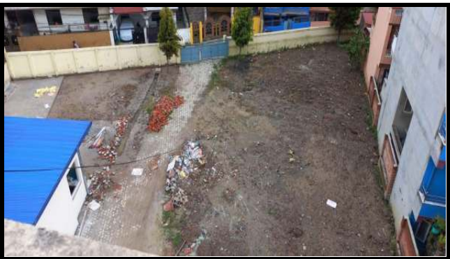
Another view from the 4th floor