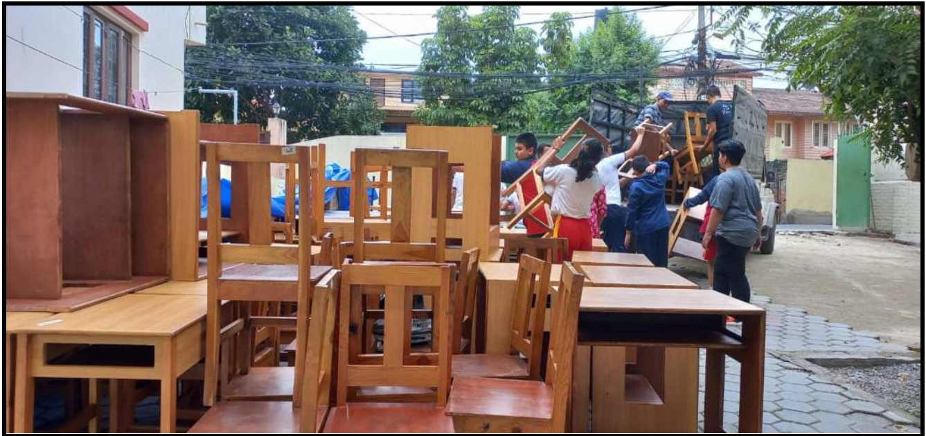
Annex B furniture being loaded onto the truck

The incentive for the children's hard work was momos (a type of dumplings). The kitchen and admin ladies actually made 645 momos for Children's Day on 15th September.