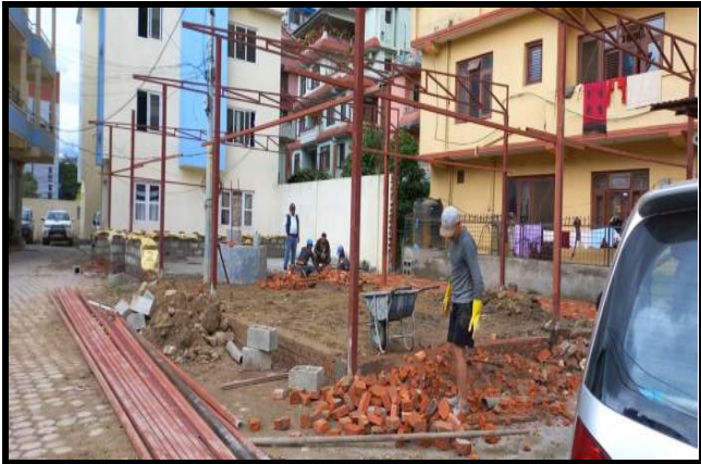
A worker clearing the field for the futsal area