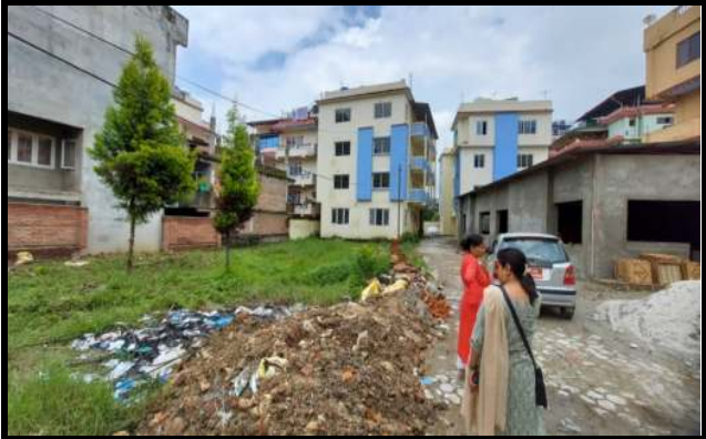
Dining/multipurpose hall in the making