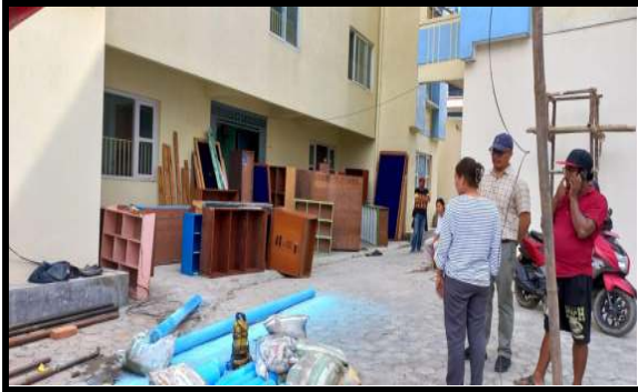
Waiting for directions to place the furniture

The task of looking for a bigger space and moving has been going on for over 7 years and is definitely not a small one. Getting the new space ready is another huge task. On Tuesday, September 12, exactly one week from the day we started moving, school reopened so that normal classes could run. God's special blessings were indeed felt in our human efforts.