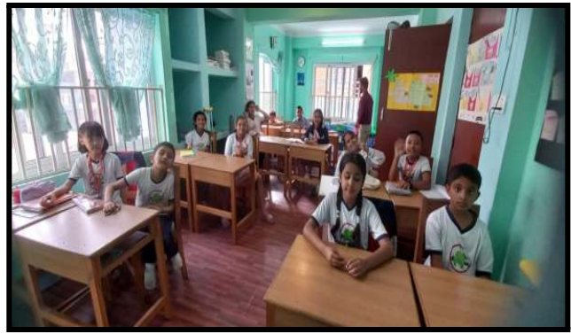
Grade 5 class ... enjoying their new space