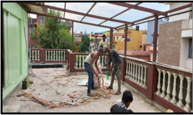
Dismantling the old site