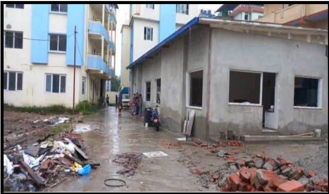
The dining hall taking shape