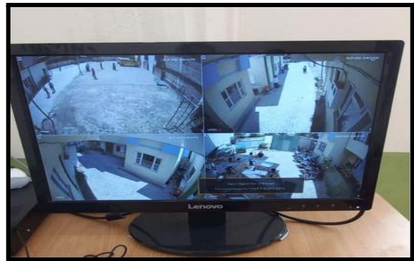
in active use