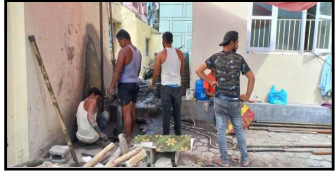
Digging 120 feet below for groundwater