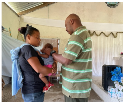
CONNECTION AND PRAYER AT PRE-DISTRIBUTION CLINIC

We will continue to share about this project as future locations are identified and filters are distributed. If you would like to continue to hear about this work, we encourage you to follow the Board of World Mission on social media. This impact would not be possible without each and every person who engages in our ministry. Thank you for being part of this mission!