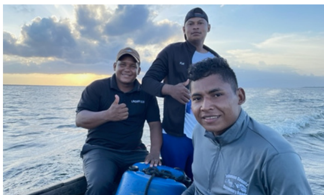
FILTERS ARE TRANSPORTED OVER LAND, AIR, AND SEA.