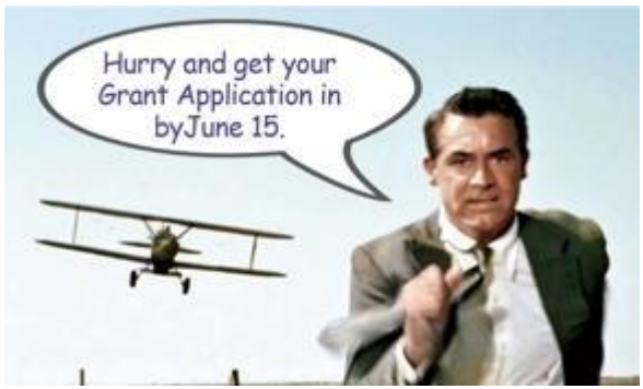
Grant applications are due June 15

The IBOC introduces its latest offering, a hot/cold spill-proof tumbler! This double-walled travel mug includes a silicone hand grip and a flip-top AS plastic lid featuring a patented snap-locking closure. Vacuum insulated and copper-lined, this mug will keep your cold drinks cold for 12 hours and your hot drinks hot for over 8 hours. • See website for further details. • store.moravian.org